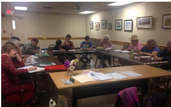
WIO workshop in September 2018 at the Greenville Library, Greenville NY

Twenty-four years ago a WIO workshop began in the rural community of Greenville, NY. The local library in the tiny village hosted writers who met for a one-week intensive. People returned year after year, brought children and grandchildren, friends and neighbors. The children and grandchildren grew into adults and some became professional writers and moved across the country. Some were second home dwellers who shuttled between New York City and Greenville, some were native farmers who had lived on the land for generations. All came together year after year to share stories in writing and they bonded with each other. At the time when the workshop began I was living with my husband in a nearby community, and since moved thousands of miles south. I missed the mountains and each year made a pilgrimage back to the magic I had experienced and remembered. 2019 will begin a new chapter of holding a WIO workshop elsewhere in the mountains because the Greenville Library is no longer able to support this workshop. Students and I are looking into ways to provide a new workshop in a new location. News as to our success will be announced.