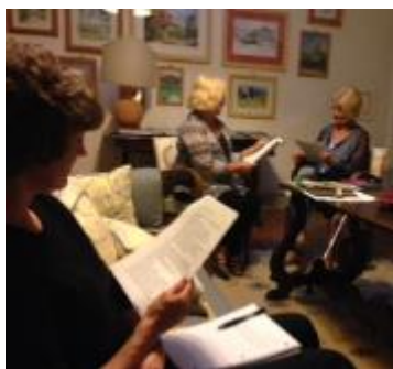
One evening salon and the reading of a 10-minute play