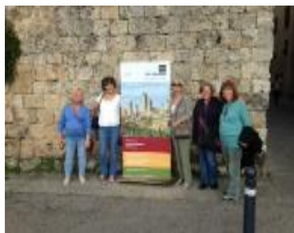
On a day trip to San Gimignano, with its medieval towers, and lunch high above the 13th C Piazza della Cisterna that overlooked the valley below.